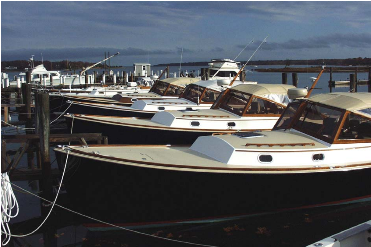
Four Shelter Island Runabouts at rest at Coecles Harbor Marine